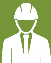
SOUTH EAST DIVISION DIRECTOR TBC